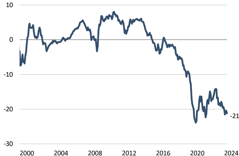
CUMULATIVE RELATIVE RETURN SINCE PRE-PANDEMIC LEVEL

December 31, 2019 – May 31, 2024 • Percent (%)