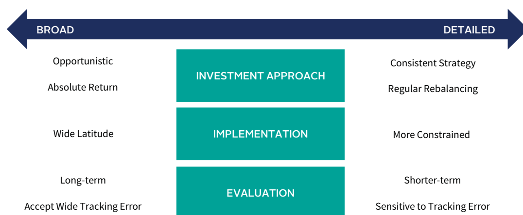
FIGURE 3 KEY FACTORS FOR DETERMINING HOW BROAD OR DETAILED TO MAKE YOUR POLICY BENCHMARK

How broad or detailed your policy benchmark should be is a function of three key factors: your overall investment approach; how much latitude you, your staff, advisor, or outsourced CIO will have in implementation; and the time frame over which you are comfortable evaluating portfolio performance, as shown in Figure 3.